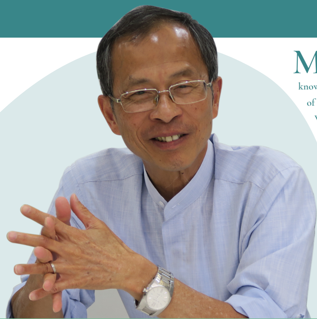
MR THE HON JASPER YOK-SING TSANG 1968 HKU Graduate (Mathematics)

Mr the Hon Jasper Yok-sing TSANG was widely known as the former president of the Legislative Council. With a glint in his eyes, he joked, “I was amused when invited by secondary schools to hold talks on career planning. Sarcasically, I did not have a specific career goal even at the time when I was graduated from HKU.” Seeing my skeptical look, Mr Tsang revealed how he paved the road to law and politics.